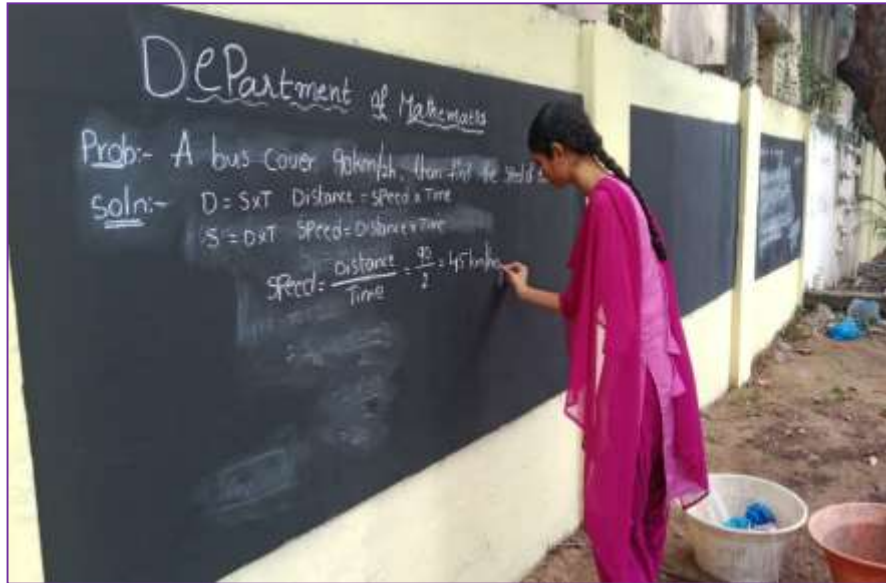
Students Writing the Problem