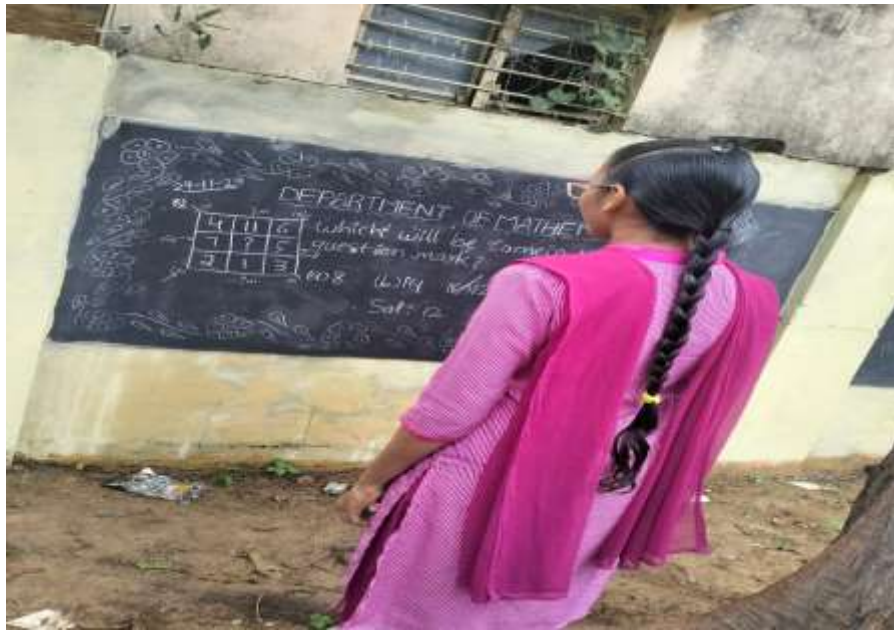
Student Learning the Problem