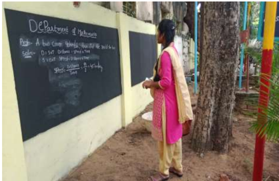
Student Learning the problem