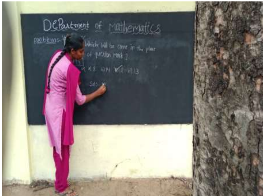
Student Solving the Puzzle