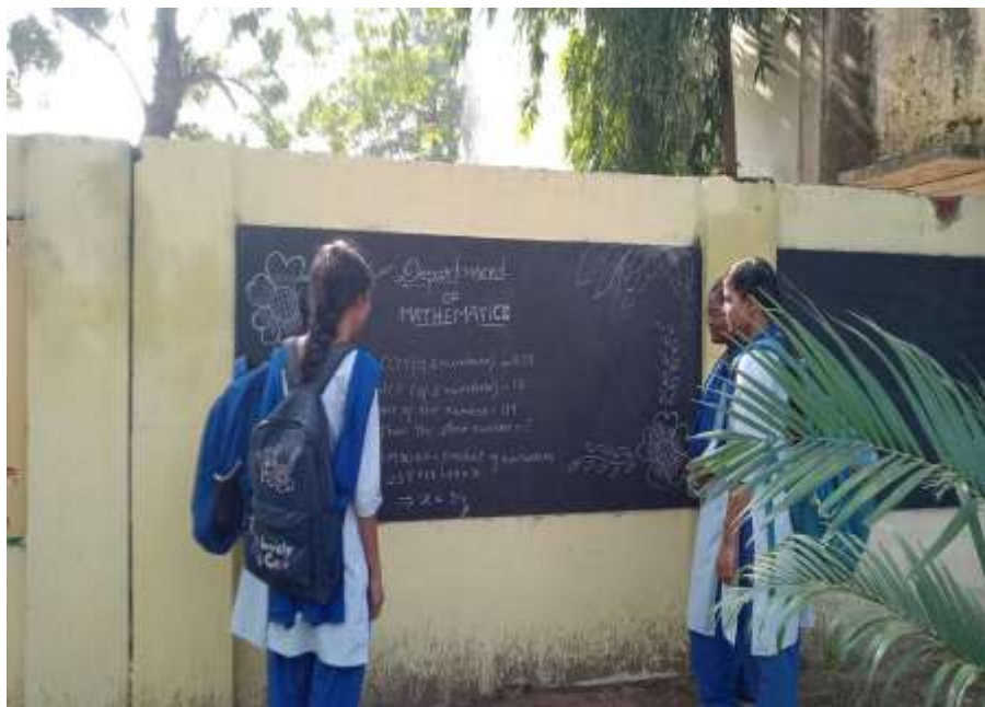
Juniour College Students Learning the problem