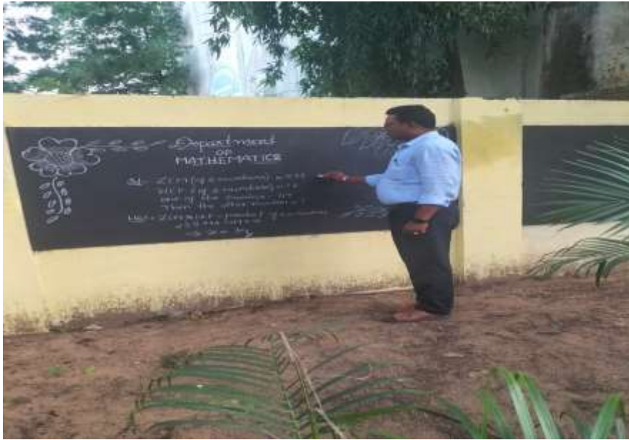
Staff Observing the problem