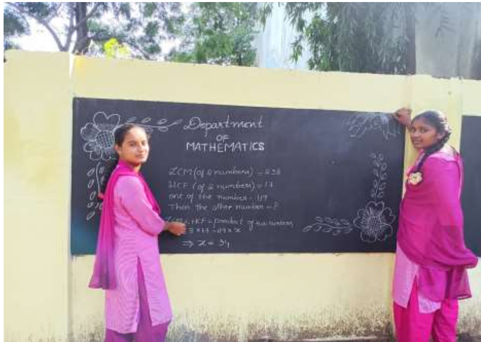
I Year Students Solving the Problem