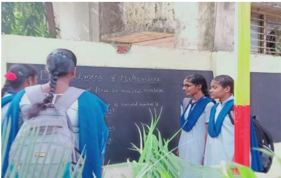
Junior College Students Learning the Problem