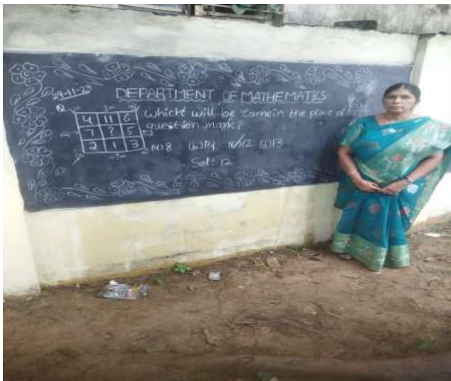
Maths Faculty Observing the Activity